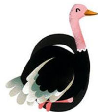
around the ostrich's body