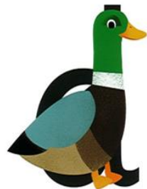
over his back and around the tail, up his neck and down to his feet