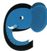
around the head and down the trunk