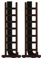
ladders in a line