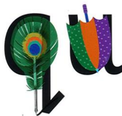
around the feather and down the pen