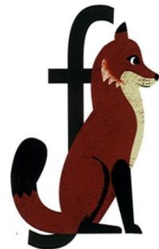
over his ear, down to the tail and across the jaw