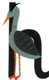
from his head to his feet, up and over his back