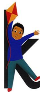
down the body, up the arm, down the leg