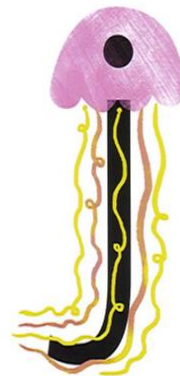
swoop down the tentacles and dot the body