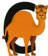
curl around the camel's back