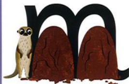
meerkat, mound, mound