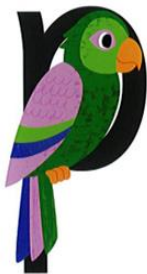
down his body, around his face