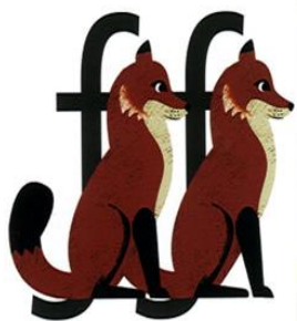
two foxes facing forwards