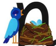
down the bird and over her nest