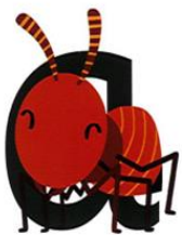
around the head, down the body