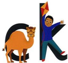
the camel stood by the kid