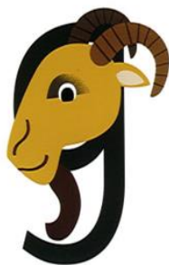
start at his ear, around the face and down the beard