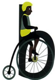
down the person and around the wheel