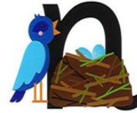
down the bird and over her nest