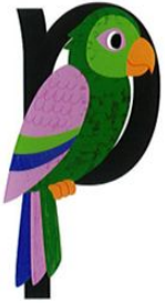
down his body, around his face