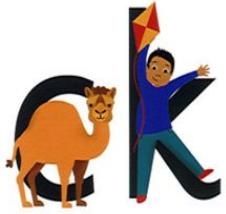
the camel stood by the kid