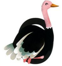
around the ostrich's body