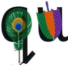
around the feather and down the pen