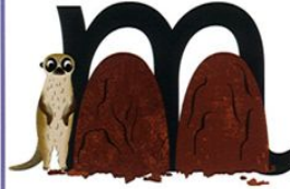
meerkat, mound, mound